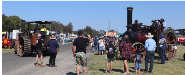
Model-T ford ▲ Steam traction engines ▼ agricultural equipment ▼