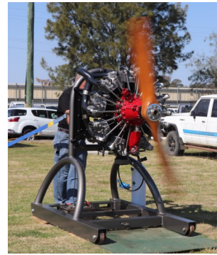
Circuit race cars ▲ radial engine running ►